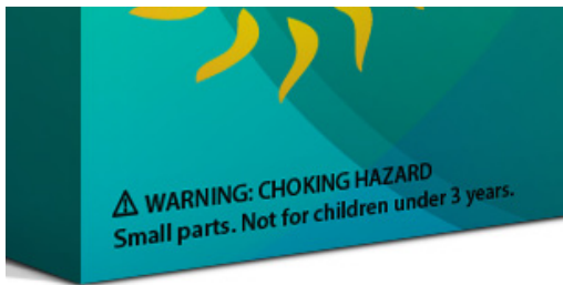
Close-up of the choking hazard label.