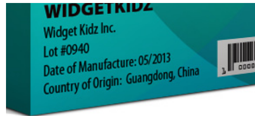
An example of a children's product box with a compliant tracking label. The Consumer Product Safety Commission does not specify formatting, placement, or size requirements for tracking labels.