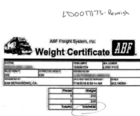
An example of a POD and reweigh certificate

The documents can be viewed as PDFs, which will allow you to see who signed for the shipment and if there were any damages or shortages noted on the document.